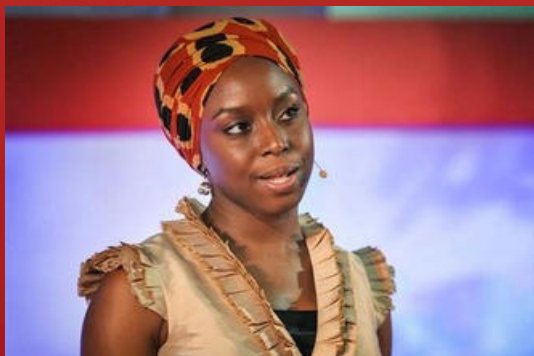
Chimamanda Adichie - TEDGlobal 2009