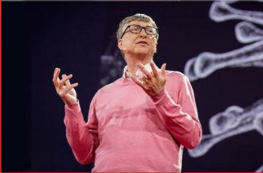
Bill Gates - TED 2015