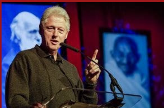
Bill Clinton - TED Prize 2007